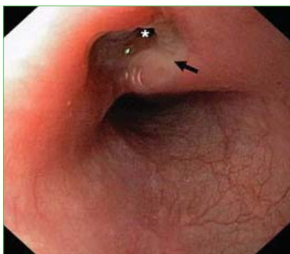
Fig. 1. Endoscopic view of the perforation of the proximal oesophagus (asterisk) with pus (arrow) running out from the orifice.