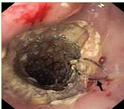
Fig. 3. An early mucosal in-growth over the upper margin of the stent and through the uncovered part of proximal end. Pursing string marked with an arrow.