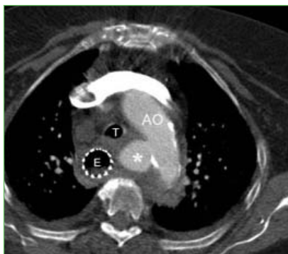
Fig. 4. Calcified aortic arch (AO) with pseudo/aneurysm (asterisk) and mediastinal haematoma surrounded trachea (T) and the oesophagus (E) with a metallic stent and intraluminal blood clot.

marked with hemo-clips and a covered metallic self-expandable oesophageal stent (FerX-ELLA Boubella E, ELLA-CS, Czech Republic) was introduced to superimpose the oesophageal perforation. This type of stent is made of stainless steel, the flared proximal end is partly uncovered and has pursing string for removal at the proximal end. The patient improved with complex intensive therapy (including meropenem and fluconazole). A control chest X-ray showed the proper position of the oesophageal stent (Fig. 2). An aortic arch pseudo-aneurysm was considered to be an inflammatory aetiology, not suitable for any surgical or endovascular therapy. A control endoscopy two weeks later found an early mucosal in-growth over the upper margin of the stent and through the uncovered part of proximal end (Fig. 3). Pulling out the string