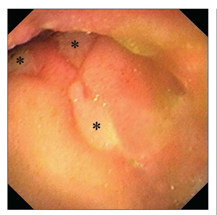
Figure 5 / Obr. 5 Tight sigmoid stenosis with multiple ulcers (asterisks) and surrounding non-specific inflammatory changes was diagnosed at colonoscopy.

Při koloskopii byla zjištěna těsná stenóza sigmatu s mnohočetnými ulceracemi (hvězdičky) a nespecifickými zánětlivými změnami.