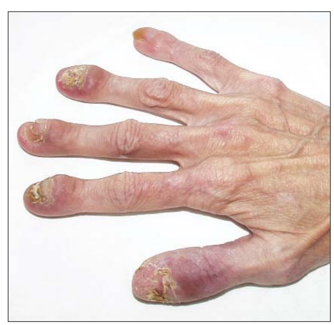
Figure 2 / Obr. 2

signs of myopathy. The patient had had regular menstruation (despite of cachexia) and no gynaecological complains. She had been suffering from diarrhoea and abdominal cramps, these symptoms worsened one month before admission together with a new onset of dysphagia for solids and low-grade fever. The patient was of small stature (152 cm), cachectic, weighting 18.5 kg (body-mass index 8.0 kg/m²). She was of childlike appearance, with a keel-shaped face, nasal prominence, prognathia with small mandible (with very limited motion in the temporo-mandibular joints) and protuberant ears. There were evident signs of chronic oral and nails candidiasis (Figs 1 and 2), confirmed by subsequent culture. In laboratory tests, there were severe iron-deficiency anaemia and borderline leukopoenia, evident signs of T-cell dysfunction (decreased CD-3+ T-lymphocytes, increased T-lymphocytes γ/δ), normal serum immunoglobulins concentrations, normal calcaemia (but metabolic bone disease) and normal thyroid function. HIV testing (1,2) was negative. Antibodies against endomysium and tissue transglutaminase were negative. Connective tissue disease was excluded, too. There was a severe proteino-energy malnutrition (with extremely low serum concentration of prealbumin and transferrin). Abdominal ultrasound showed moderate splenomegaly, gallbladder stones and nephrolithiasis. Tight stenosis of the distal oesophagus was found at